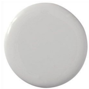
Repose Gray 7015 Sherwin Williams