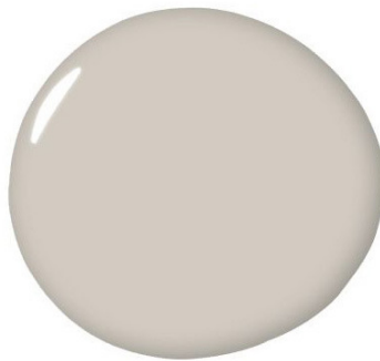
Agreeable Gray 7029 Sherwin Williams