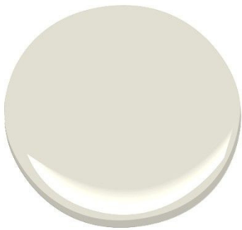
Halo OC-46 Benjamin Moore

Wall Colors – These are some of my favorites right now: