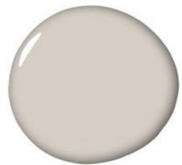
Modern Gray 7632 Sherwin Williams